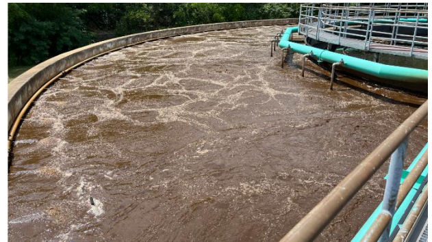
Wastewater going through the treatment process. It looks worse than it smells, I promise!

Our Wastewater Treatment Plant is old. It was built in 1989. The industry standard for a Treatment Plant is about 20 years, yet 35 years later many of the mechanisms in our plant are original. Many pieces of our equipment are considered